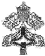
Pope Francis I