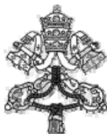
Pope Francis I

And his special intentions for September