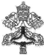
Pope Francis I

And his special intentions for September