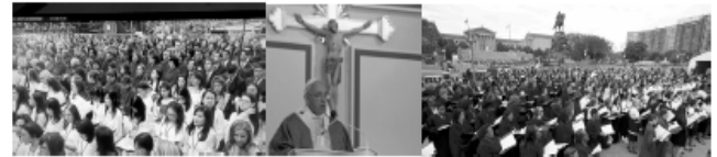
This is a free-will offering concert.

Free parking is available in the Cathedral parking lot. For additional information, contact the Office for Divine Worship. 215-587-3696