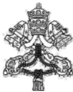
Pope Francis I